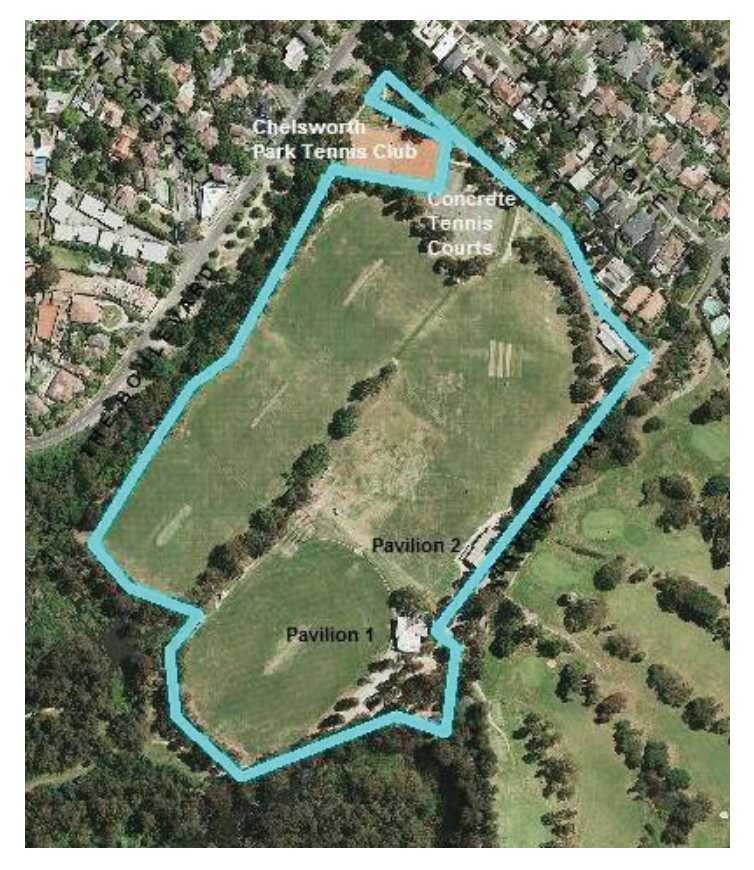
What title is the Chelsworth Park Tennis Club (CPTC) on?